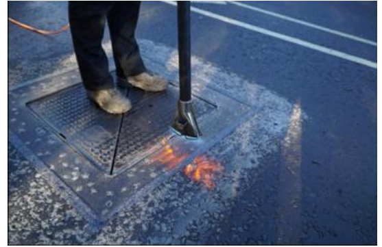
Photo shows anti skid aggregate throughout the material